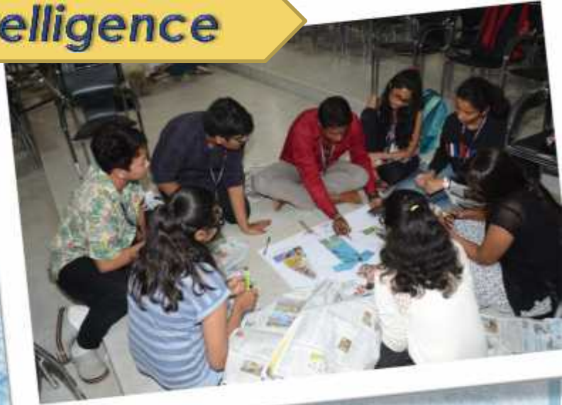
Chart Making -The accolades of the visual aptitude provide one to sketch any ideas in a jiffy. Students artfully produced the significance of the lush green vales with torn newspapers and produced umpteen such creative instances

When 'objective correlative' of any emotion is realized through the scintillating images, then surfaces the spell of visual spatial intelligence. According to the postulates of Gardner's multiple intelligence, the dominance of visual intelligence is synonymous to the experience of phantasmagoria. The systematic clockwork of mind mapping settles in when the visually intelligent individuals function even in the physical absence of the stimuli. The facsimile of any image is replicated through the skills of this intelligence in a three-dimensional space. With the utterance of any word, whenever the mind sketches the respective idea/s associated with the word, one is recognized to be spatially intelligent